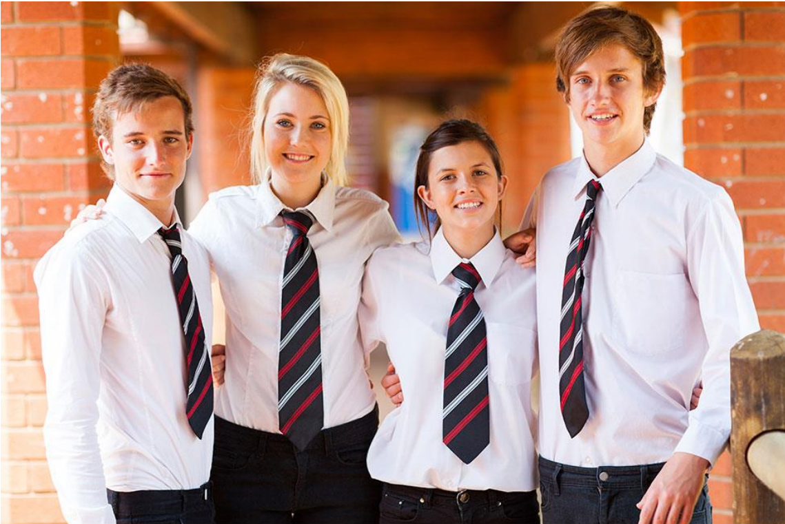
Most schools require uniforms