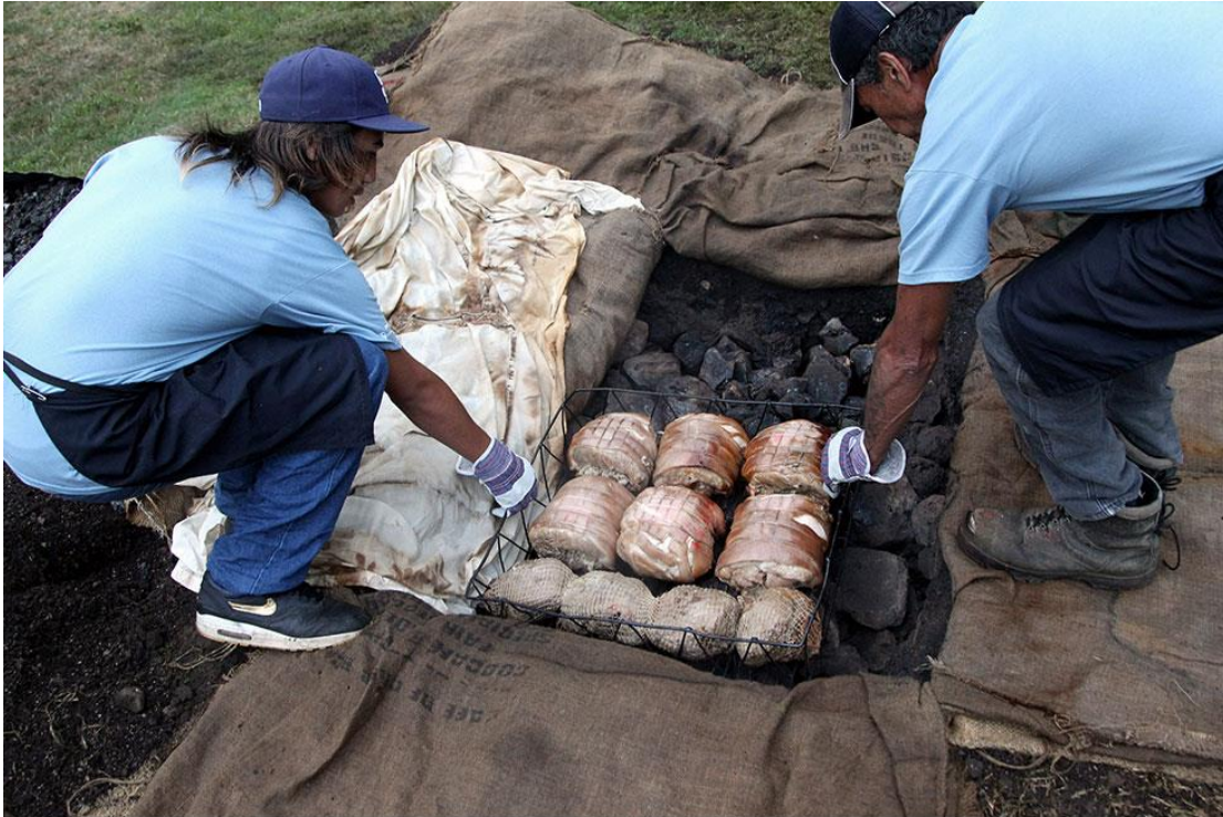
A hangi, or underground oven

At school, you will study English, math, art, and science—and you will have the chance to take extra courses like tourism and catering. You will also be allowed to join in extra-curricular activities like sports clubs, drama groups, and music. You should try to take part in as many of these activities as possible, as they are a good way to meet people. Kiwis are generally very relaxed and informal, and most Study Overseas students find it very easy to make friends at school. The school year starts in late January and ends in early December.