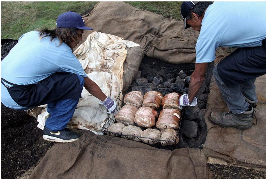
A hangi , or underground oven

On the weekends, a lot of New Zealanders have a barbecue at home, and they invite friends over. For special occasions, some families make a hangi , which is a traditional Maori dish of meat and vegetables cooked in an underground oven. Your family will ask you about the foods you like, but remember that host families do not get paid for hosting you. Discuss your preferences or tell them about any foods you cannot eat for health reasons, but you must remember that you are not staying in a hotel!